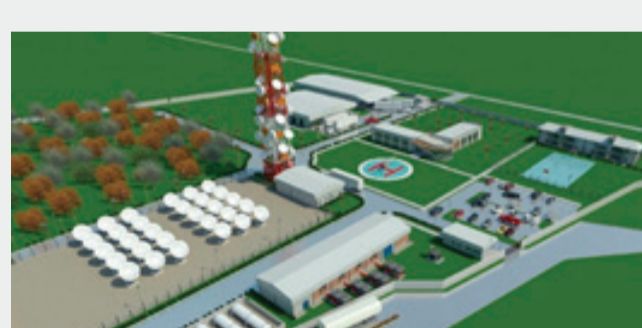
Sagamu Data Center Campus, Ogun State, Nigeria

With on-going projects like the construction of the new Tier III Data Center in Appolonia City, Accra, Ghana; construction of the Sagamu Data Center Campus in Ogun State, Nigeria; expansion of the Lekki Data Center in Lagos; extension of submarine cable capacity to Burkina Faso from Ghana and Cote D'Ivoire, MainOne is continuing to invest and expand on its vision to remain the leading provider of innovative, world-class, digital services across West Africa.