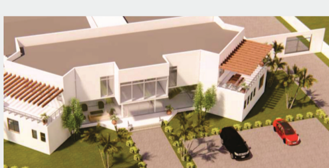
Appolonia Data Center, Accra- Ghana. To be launched Q1, 2021

10 years ago, MainOne started a journey to bridge the digital divide and connect West Africa to the world. Today, with an established culture, 500 employees, over 1,000 customers, service delivery to 10 West African countries, numerous successfully executed projects MainOne has remained focused on its vision but there is still a lot of work to be done.